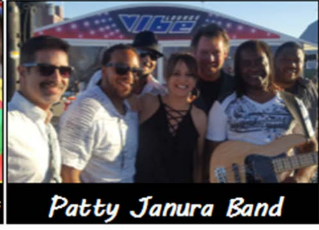
International Food Festival • Carnival Style Rides & Games • Raffle • Bingo • Haunted House Trick-or-Treating • Jump Houses & Rock Wall • Live Music & Dancing