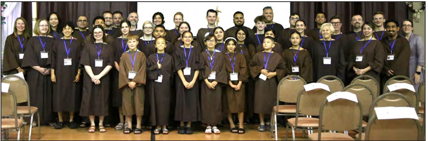
Getting ready to receive sacraments at the Easter Vigil